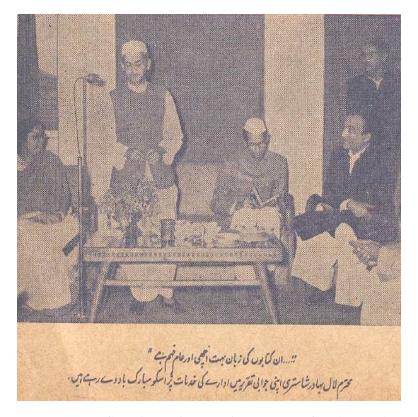
Mr.Lal Bahadur Shastri at the inauguration ceremony of Derh Matwalay