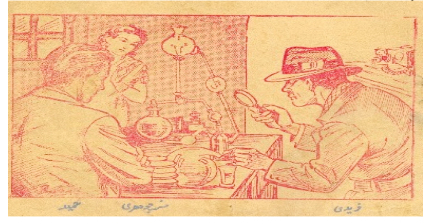
A sketch form Khofnaak Hangaama showing Fareedi and Hamid

The impact of colonial ideals of an intellectual are also felt when it comes to the attire of characters in post-colonial detective novels. Fareedi, Hamid and Imran all are always shown to be dressed in Western dress<sup>35</sup> and not just any Western dress but a dress "suitable" for an intellectual. Thus, the heroes are shown dressed up in a necktie, felt hat and a coat. This depiction of the hero as a Westernized individual becomes complete when we combine it with sketches from Safi's initial novels<sup>36</sup>. Although, after the first few novels, the later novels do not have any sketches in them but the ones that do have the sketches are very informative.