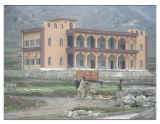
(Work going on around the herbarium)

and it practically took 6 months to transport the equipment. What an irony! The university is a shambles while the huge deteriorating workshop has been converted into a garage for the university's fleet of buses; the shabby residential quarters of the workers have been turned into student hostels. The better houses built for officers are where the faculty resides now. Strange buildings have been turned into much stranger outlets.