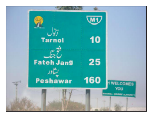
(On the Motorway heading for Malakand Division)

Chakdara, Malakand. Does the name ring a bell? It better do since Malakand is about 26 kilometer from Mingora. One of the hottest places on mother earth till 3 months or so ago. Yes, the most happening place which was the center piece of terrorism with Metal fighting metal, Souls fighting Souls. Pakistani fighting Pakistanis. Muslims fighting Muslims. Right?