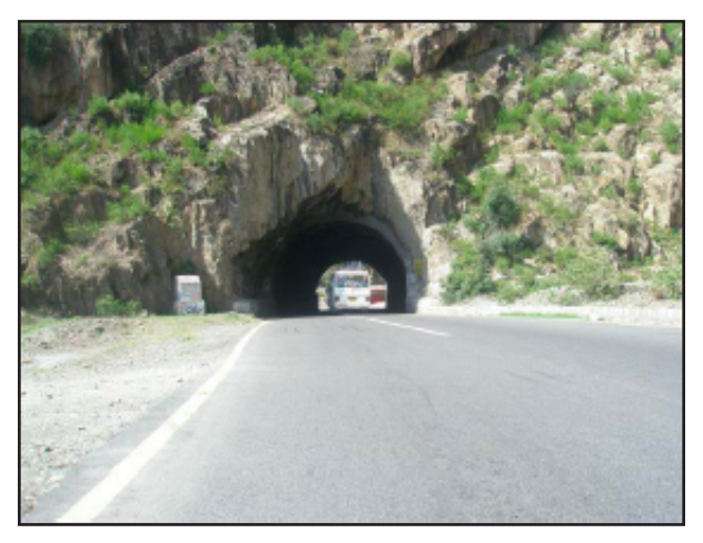
(The only tunnel on the way to the Malakand Top)

At the foot of this all-weather pass is the Dargai Fort and at the Top is Malakand Fort, where Pashtuns led by the 'Mad Mullah of Malakand' rose against the British in 1897.<sup>3</sup>