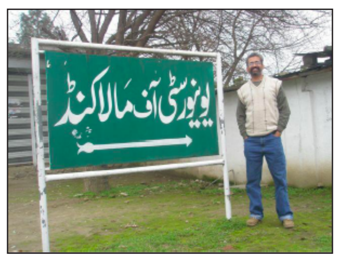
(Proof that I was at the University)

I was amazed to see the size of the university which was close to around 1,400 or so acres and surprisingly included an entire hill within its periphery. I have yet to visit a university in my entire life which owns a hill. Yes, an entire God damn hill!