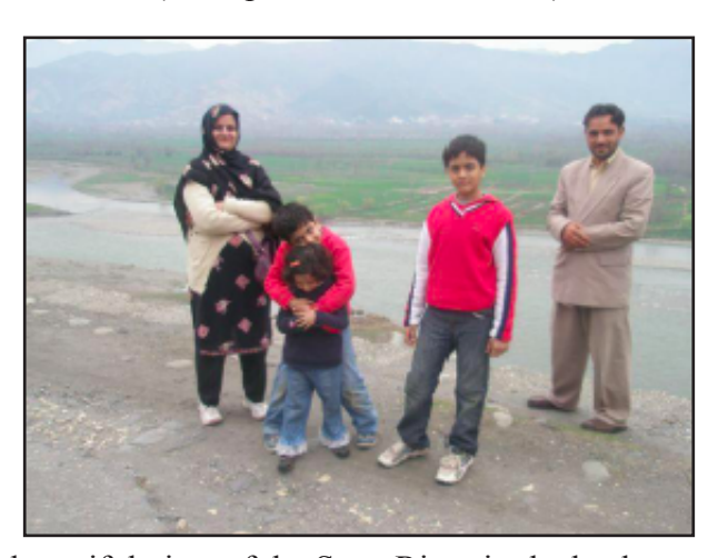
(A beautiful view of the Swat River in the background)