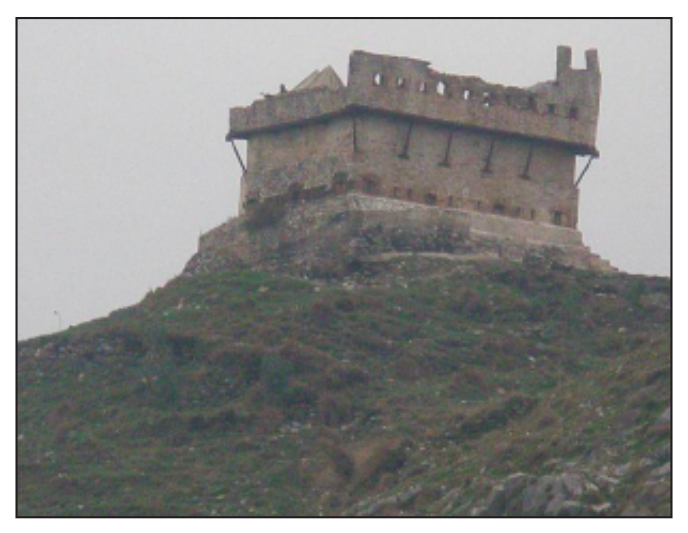
(A beautiful view of Damkot Hill with the Churchill Picket)

became famous; Winston Churchill, for whom the picket is named). Unfortunately, the Pakistan Army now uses the fort so Damkot Hill is off limits to visitors.<sup>2</sup>