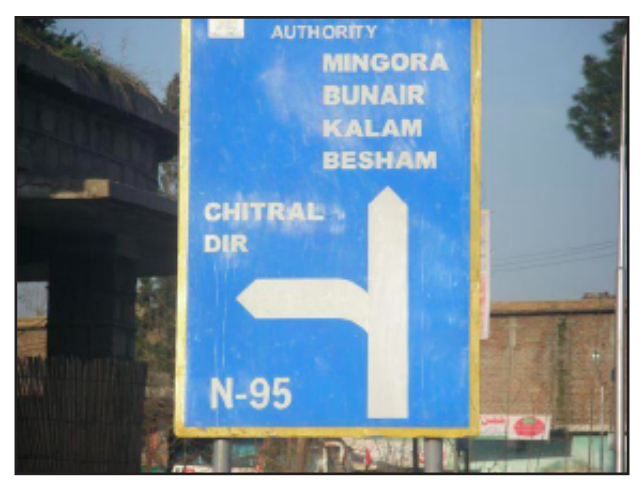
(Where do we want to go today – Chitral or Swat?)

Once you drop off Malakand Top, you reach an unassuming Batkhela village. The most interesting thing about Batkhela is (which most Pakistanis may not know) that it hosts the longest bazaar in the entire Pakistan. I heard that it is between 3-5 kilometer long. Indeed, with the traffic rush; it took us for evertoget through this long, snaky bazaar.