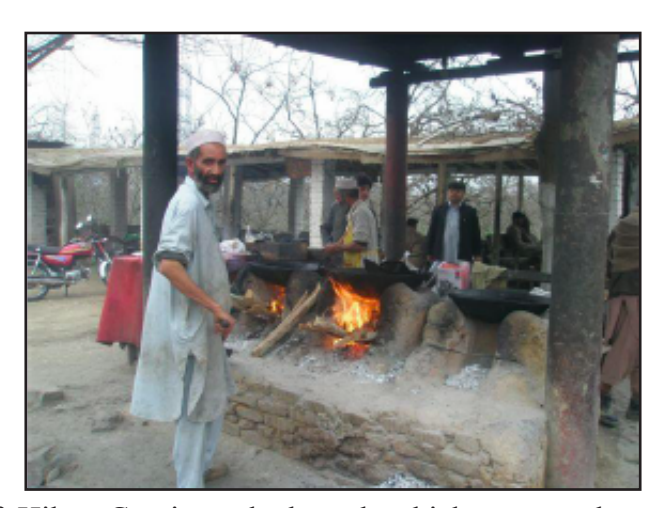
(Our makeshift Hilton Continental where the chickens come home to roost along with the fish before they die and scavenged by animals called 'Humans')

After touching the skies we retreated back to civilization and before reaching the side of the river, we picked our Fried fish from the makeshift Hilton Continental at the mouth of the road skirting down to the Swat River.