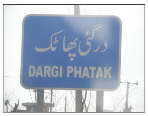
(The entrance to Dargai)

We just breezed through Mardan, Takht-e-Bahi (although we did stop for 5 minutes for Qahwa) and headed for Dargai which is about a 40 minutes drive from Mardan City.