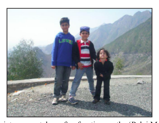
(This picture was taken after feasting on the 'Palai Maltay')

On the way back, we stopped to buy 'Palai Maltay' (type of Oranges) from Malakand top. I tell you these are the best 'Maltay' you can get in the entire N.W.F.P province just like the 'Khanpur Maltay' in Punjab or the 'Sargodha Kinoo' from Sargodha.