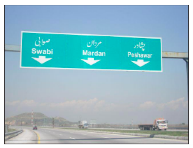
(Getting slightly closer – So close yet so far away)

Well, talking about breakfast; my wife is up from her deep slumber and is indeed in the kitchen making breakfast for me. See. I told you I was good at this.