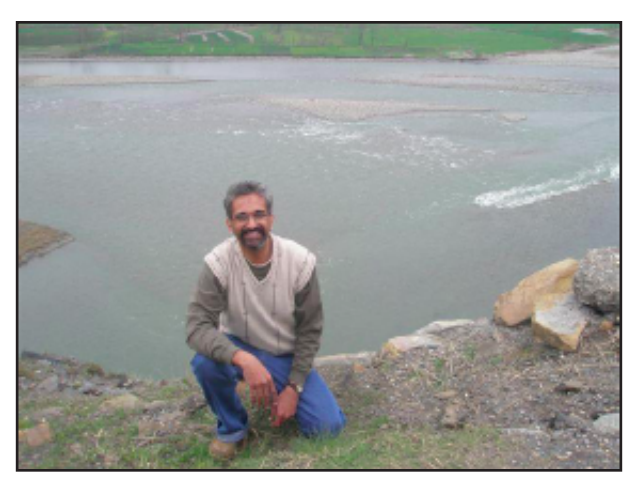
(His Royal Highness before he was thrown in the river)

After touching the skies we retreated back to civilization and before reaching the side of the river, we picked our Fried fish from the makeshift Hilton Continental at the mouth of the road skirting down to the Swat River.