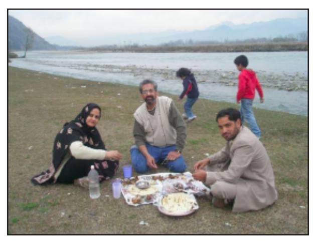
(The metaphorical 'Last supper' by the Swat River)

On the way back, we frolicked at the beautiful fall (Abshaar) close to the Damkot Hill. There seem to be no particular name for this Abshaar but we stopped and enjoyed anyways. Clean air. Clean water. Clean fun! We are loving it minus the McDonalds.