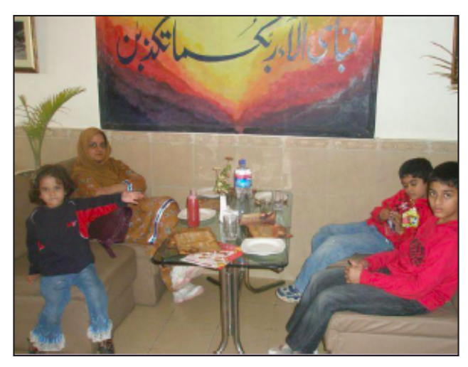
(Family lunch @ Rashakai about 95 kms from Islamabad)

While we were stuffing our faces @ Rashakai, the first bomb exploded. No. No. Not an explosion, rather I saw a platoon of the Pakistan army arrive at Rashakai from Rawalpindi not to arrest us but to have lunch at the restaurant. My wife almost threw a tantrum since we were having a first bout with the army and I am sure she must be having fancy ideas already as to whether we should proceed ahead or return to our pit hole aka Islamabad.