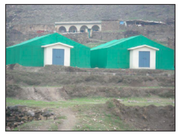
(The green houses among a rhapsody of grotesque planning)

There is a herbarium in the making along with two green houses already in place. Instead of concentrating on the WATSAN yes water & sanitation issues of the student and faculty hostels, I wonder what is the point in squandering public money on brick & mortar first. They can always be developed once the Maslow's needs of hierarchy are in place.