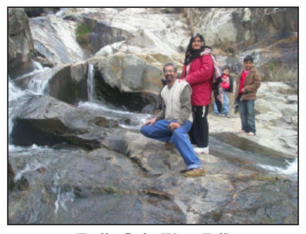
(Frolic @ the Water Fall)

On the way back, we frolicked at the beautiful fall (Abshaar) close to the Damkot Hill. There seem to be no particular name for this Abshaar but we stopped and enjoyed anyways. Clean air. Clean water. Clean fun! We are loving it minus the McDonalds.