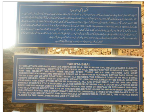
(The history of Takht-e-Bahi at the entrance of the ruins)

altitudes. What one can find in the Taxila museum is in no way close to what we saw on top of these hills. We were actually walking through, breathing in and visualizing history when we visited the huge stupas, amazing chapels, monk's quarters, study chambers, meditation rooms, refectory etc. The views across the plain, south-west to Peshawar and north to Swat, were an added bonus.