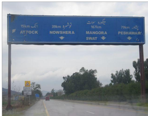
(On the Grand Trunk Road headed for Nowshera)

Another reason I found recently around 4:30 in the morning, when I happened to read the above verse in the Quran. It somehow captures my thirst for traveling and knowledge: the ‘wandering dervish’ I have come to be known as by my friends. I realized that my heart pumps with fresh blood during each newer and crazier escapade down un-beaten tracks to remote locations within the land of the pure: Pakistan.