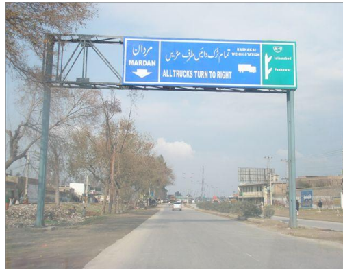
(Detour off Nowshera toward Mardan)